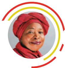
DR NKOSAZANA CLARICE DLAMINI ZUMA, SOUTH AFRICA.

Dr Nkosazana Clarice Dlamini Zuma was appointed as Minister responsible for Women, Youth, and Persons with Disabilities on 6 March 2023 in South Africa. She served as Minister for Cooperative Governance and Traditional Affairs from 30 May 2019 to 6 March 2023 and Minister of The Presidency from 27 February 2018 to 25 May 2019. Dr Dlamini Zuma was elected as the first woman to lead the African Union Commission on 15 July 2012 and served until 30 January 2017.