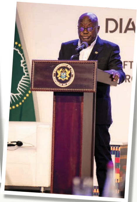
African Prosperity Dialogues 2023: (l) Delegates take in discussions (r) H.E Nana Addo Dankwa Akufo-Addo, President of Ghana addresses attendees