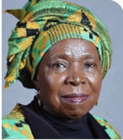
DR NKOSAZANA CLARICE DLAMINI ZUMA SOUTH AFRICA

An advisory council made up of men and women of international repute with a keen interest in the wellbeing of Africa and people of African descent. These prominent sons and daughters of Africa act as champions of the vision and objectives of the Africa Prosperity Network