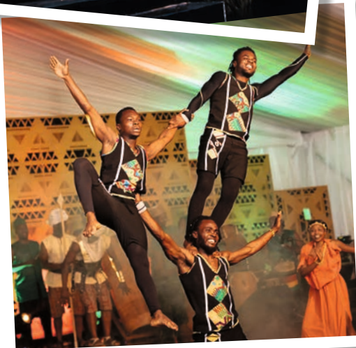
Performances from last year's awards dinner (above)